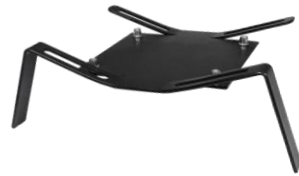
1x Table Stand